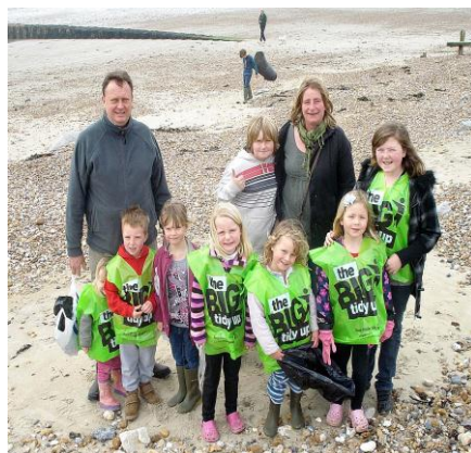
Elmer Sands residents at the annual beach clean earlier in the year.

Number 11 is said to be a figure that signifies intuition, patience, honesty and sensitivity and is considered a 'master number' in astrology and basic numerology.