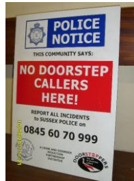
PCSO Clive Morge

Should they be persistent warn them that you will call the police should they not go away. Furthermore consider reporting any suspicious persons calling to the police on 0845 60 70 999 . Also consider reporting cold callers to Trading Standards, Consumer Direct Department on 08454 04 05 06 .